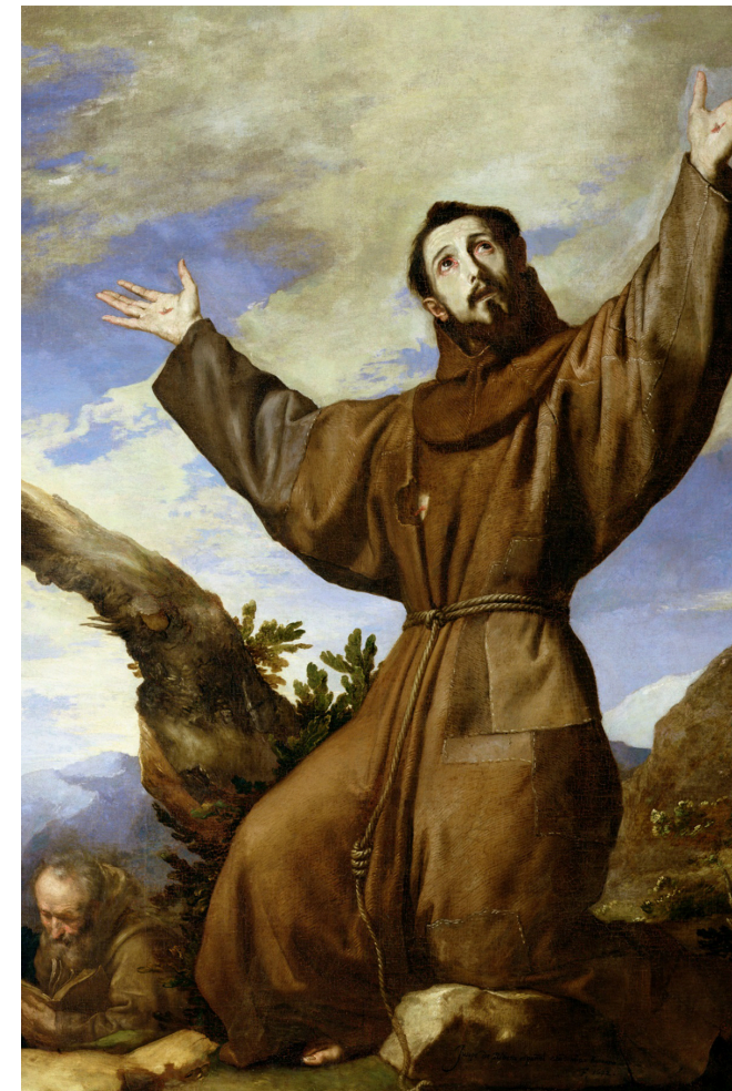
Painting of St. Francis by Jusepe de Ribera, 1639