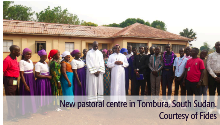
New pastoral centre in Tombura, South Sudan.