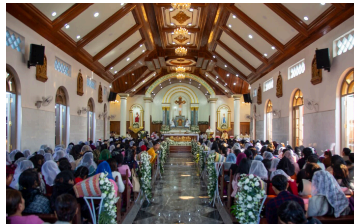
Church of St. John, Myitkyina, Myanmar.

Yambio (Agenzia Fides) – "For more than five years, you have lived under the heavy burden of violence, displacement, destroyed institutions, and profound trauma. And yet, you have not lost your humanity. I have been deeply moved by your love, your generosity, and your joy even in the midst of pain. Your resilience has left me speechless. There is an inner spiritual strength within you, silent, profound, and given by God, that has sustained. Protect it. Nurture it. Let it now become the foundation of peace. Do