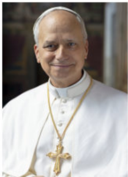
Leo P.P. XIV