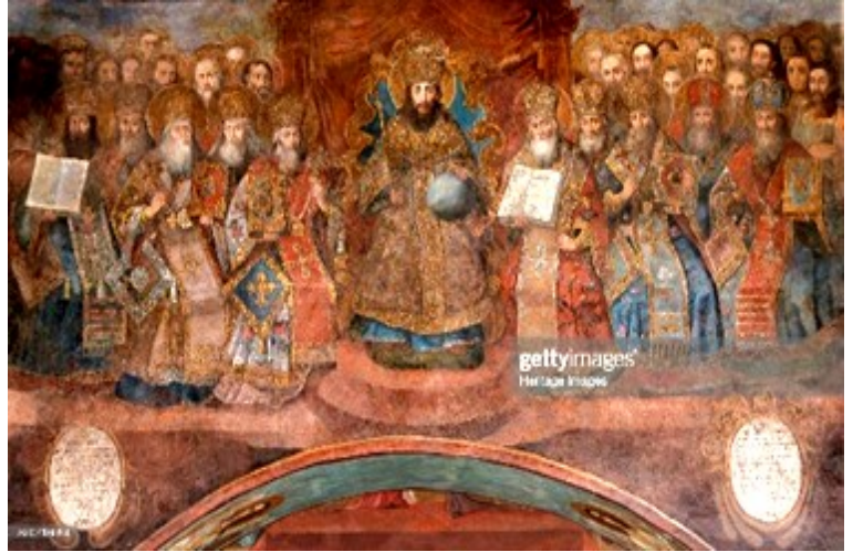
Council of Nicaea

Lent was officially created during the Council of Nicaea in 325 C.E. Originally, the rules around Lent were very strict but by the 1400s, they were gradually relaxed. Pope Gregory the Great created Ash Wednesday in the 600s. Wearing ashes is a biblical symbol of repentance and a reminder of our mortality. Wear them with pride!