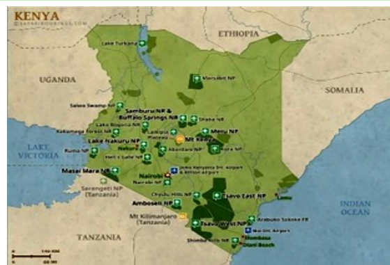
Kenyan National Parks (Safari Bookings)

There are several NATIONAL PARKS in Kenya. Visitors can arrange to go on safaris to safely see the wide variety of animal life for which Kenya is famous.