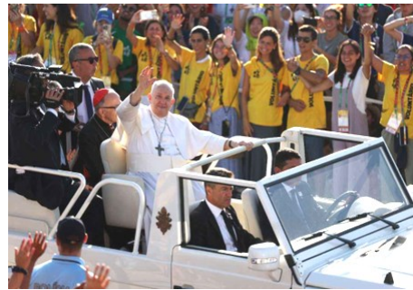
Pope Francis at World Youth Day, Lisbon August 2023

POPE FRANCIS' 2023 LENTEN MESSAGE: The Pope's 2024 message is not available at this time of writing. In 2023, his message was quite simple: