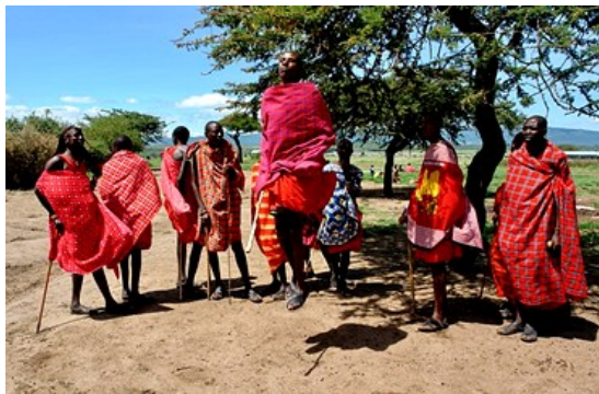
Maasai jumping (Carosaun) CCA Share-Alike 4.0 Int