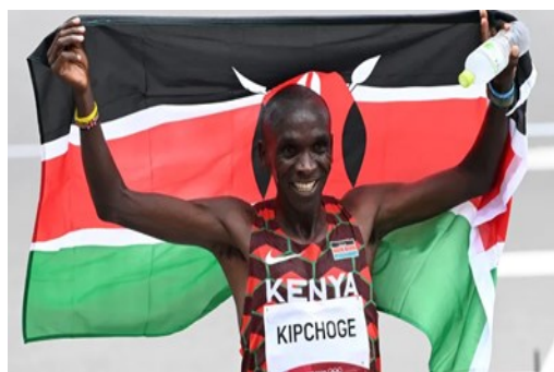
Eliud Kipchoge

The 36-year-old world record holder finished with a time of two hours, eight minutes and 38 seconds.