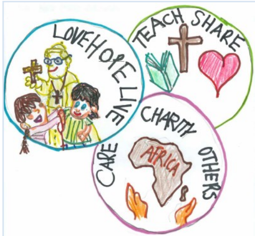
Peter Romic Melbourne - Australia