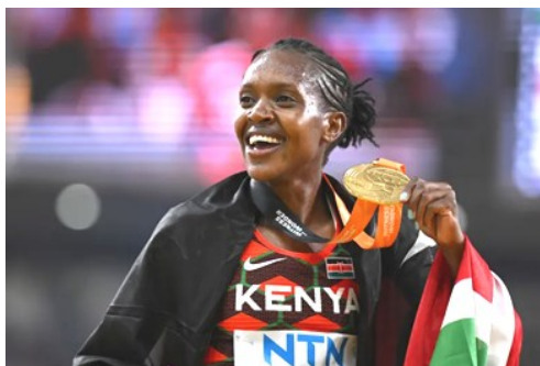
Faith Kipyegon

Kenya has had a long history of distance running champions. This has continued even today. In June of 2023, Faith Kipyegon won 1500m in a world record time of 3.58.57 in Florence Italy. In Budapest in August at the World Championships, she broke the world record in the 5000 m in 14 min 5.20 sec. Long-distance runner Eliud Kipchoge claimed his second straight Olympic gold medal in the men's marathon at the Tokyo Olympics in 2020. The 36-year-old world record holder finished with a time of two hours, eight minutes and 38 seconds.