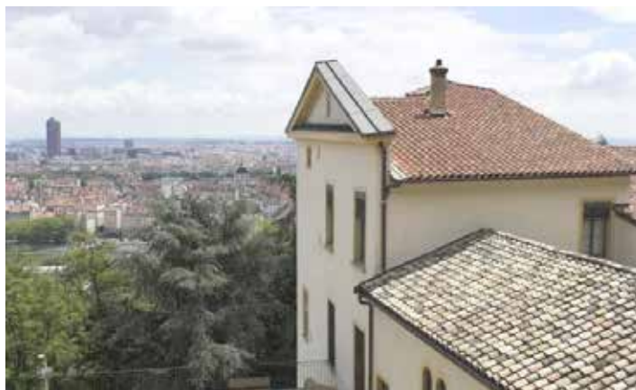
In the footsteps of Pauline Jaricot: The Family Home of the Lyon Missionary.

Why not make a pilgrimage in honor of Blessed Pauline, going to one of these places that preserve her memory? Born and died in Lyon, she rests today in the Saint-Nizier church, near the altar of the Virgin in the south transept, the very church where she experienced her conversion following the sermon on vanity. His heart is in the Saint-Polycarpe church in Lyon. It was in the chapel of Notre-Dame de Fourvière that she made a private vow of chastity