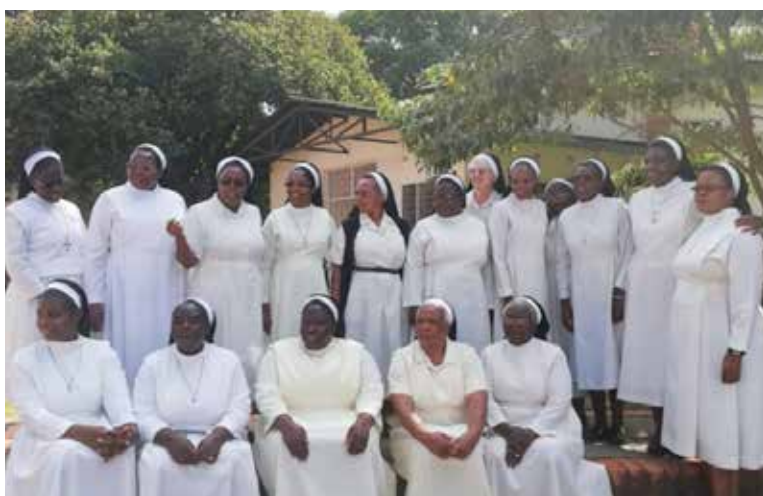
The Dominican Sisters Of The Sacred Heart