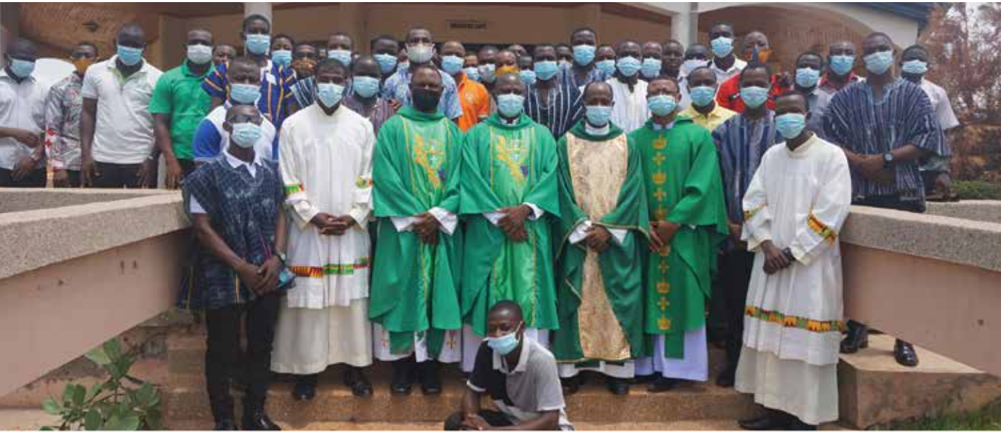
After Mass, the staff and students of St. Augustine Millennium Seminary in Tamale, Ghana, pose for a community picture.