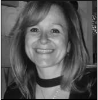
By Lori Lisi

Only the person who feels happiness in seeking the good of others, in desiring their happiness, can be a missionary.