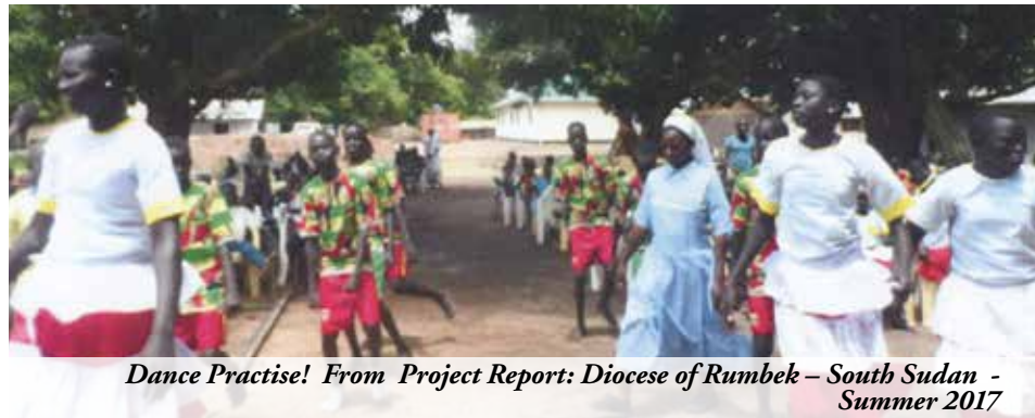
Dance Practise! From Project Report: Diocese of Rumbek – South Sudan – Summer 2017

179 years later, thousands of necessary projects and resources are supported with money raised and donated by children for other children. For example, in recent years, schools have been built or refurbished in India, Namibia and Tanzania. Of course, education is critically important so that families can have hopes for their children. The missions provide liturgical and academic lessons, which improve the overall wellbeing of the communities; the children and their families gain spiritual knowledge, literacy skills and can aspire to a brighter future. Money has been raised in Canadian communities such as Thunder Bay to fulfill special requests like liturgical dance uniforms for