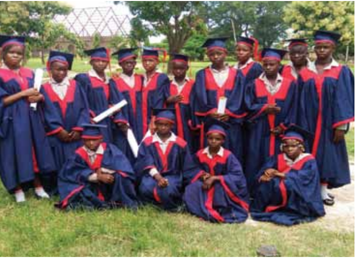
Graduates of Spiritan Nursery and Primary School, Sankera, in academic gowns