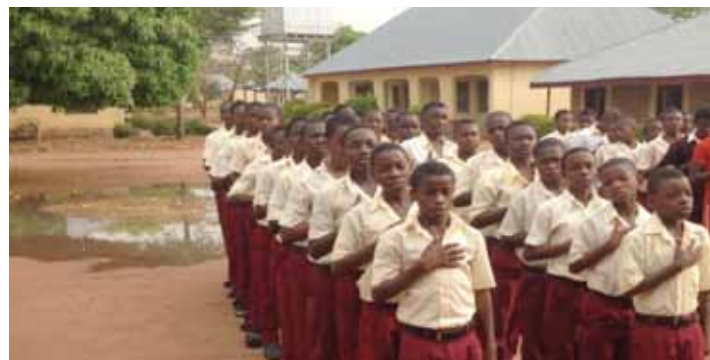
Students on assembly ground at Holy Ghost College, Sankera, Benue State