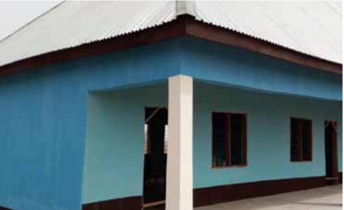
A classroom block at Fr Vincent Griffin Nursery and Primary School, Chonku. Taraba State