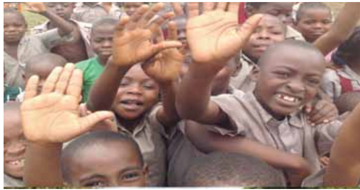
Happy Pupils of Spiritan Nursery and Primary School, Sankera, Benue State.