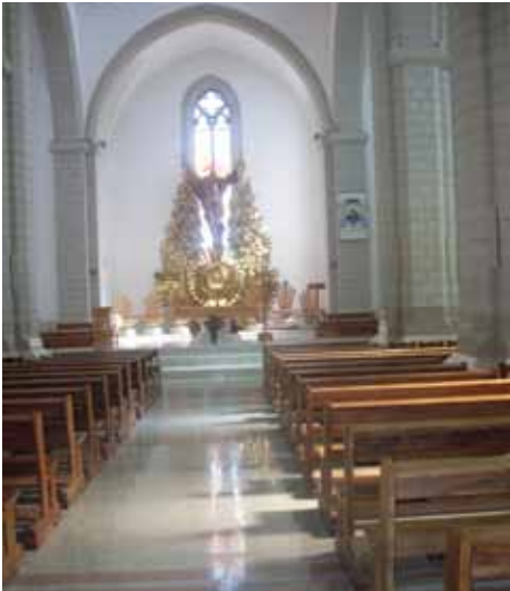
Main Aisle leading to Sanctuary.

Faith in this Central Asian nation, formerly part of the Soviet Union, was accompanied in its growth under Pope John Paul II’s pontificate. The late Pope took a particular interest in seeing the Catholic Church develop in former Soviet Republics. Under the protection of Saint John Paul II - cho-