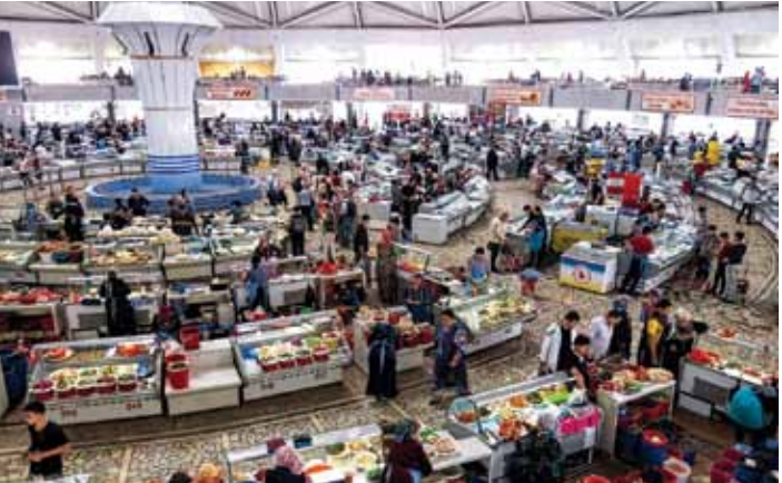
The giant Chorsu market in Tashkent.

There are also other opportunities for ecumenical and interreli-