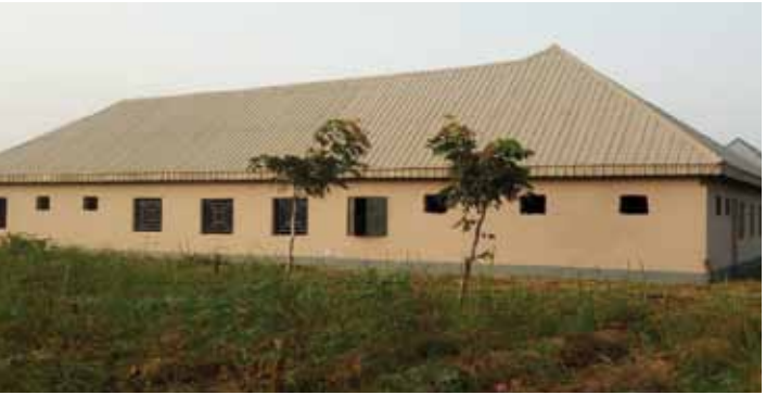
Back View of the classroom block at Fr. Vincent Griffin Nursery and Primary School, Chonku, Taraba State