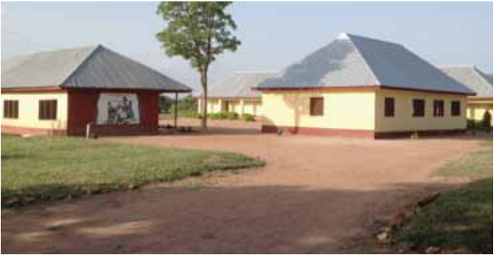
A Cross Section of the Spiritan Nursery and Primary School, Sankera, Benue State