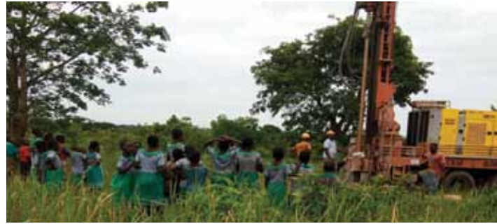
Children of Chonku village gather to watch the drilling of a bore hole at the Spiritan Youth Resource Centre, Chonku, Taraba State

The Accommodation of the Director of Spiritan Youth Resource Centre, Chonku, Taraba State, Nigeria