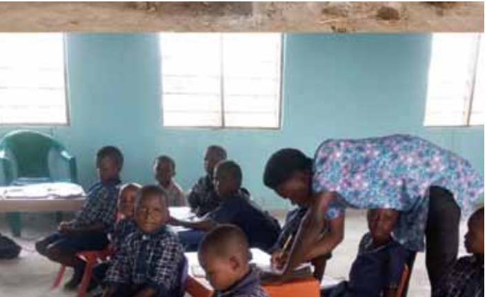
A teacher in class with pupils of Fr Vincent Griffin Nursery and Primay School, Chonku