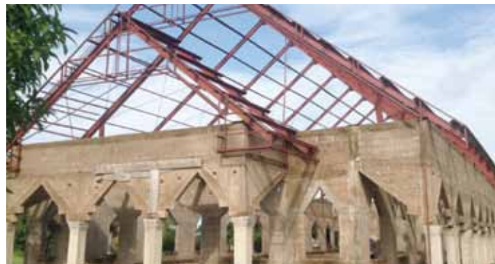
Chapel under construction at Holy Ghost College, Sankera, Benue State, Nigeria.