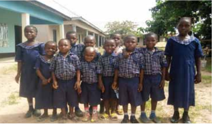
Some Pupils of Fr Vincent Griffin Nursery and Primary School Chonku, pose for a picture in front of the School Block