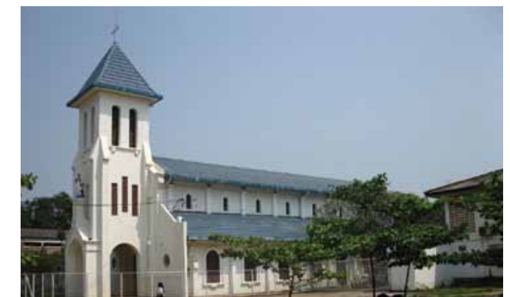
Sacred Heart Church, built in 1928 in the capital, Vientiane.

“Joyful Asian Youth! Living the Gospel in Multicultural Asia”, is the theme for the upcoming 7th Asian Youth Day to be held in Semarang Diocese, Indonesia. This is an edited version of the original story which appeared on ucanews.com 06/20/2017