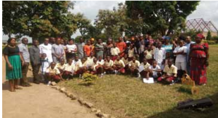
Parents the newly admitted students of Holy Ghost College Sankera pose with their children after reception Mass in October, 2017