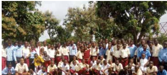
New and Old Students of Holy Ghost College, Sankera, pose for a group photograph after reception Mass in October