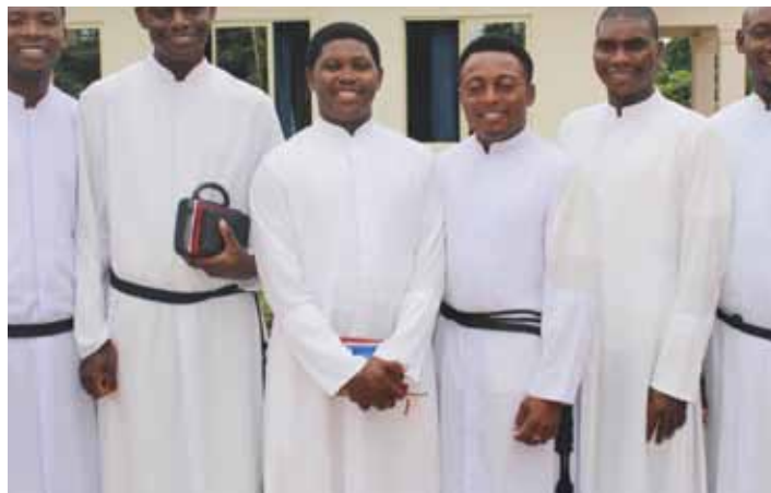
Some seminarians posted to Holy Ghost College, Sankera, Benue State