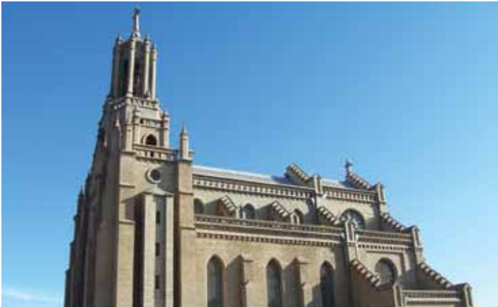
Sacred Heart Cathedral, Tashkent.