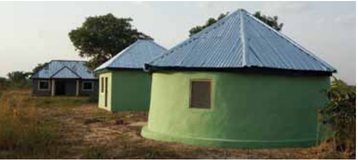
Improvised Living Quarters at the Spiritan Youth Resource Centre, Chonku, Taraba State