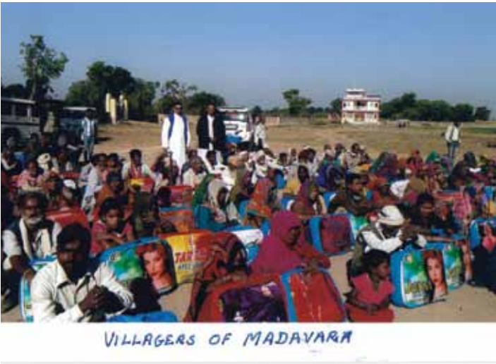
The Madavara Convent: