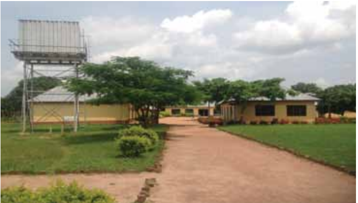
Academic Section at Holy Ghost College, Sankera, Benue State