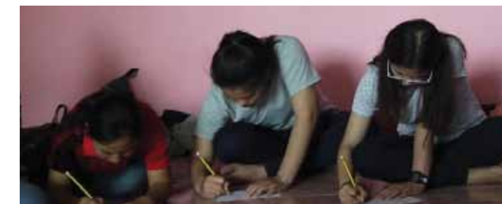
Laotian youth write down their reflections after praying during the formation camp on June 17-18

“It won’t just be about our new Laotian cardinal or the 17 mar-