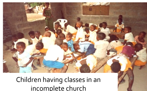
Children having classes in an incomplete church

The second project is at St Gabriel's outstation near Okija. There is no school in the area, so the only option for the few children who do attend is extensive and dangerous travel. The project is trying to raise money for the building of an early childhood and primary school.