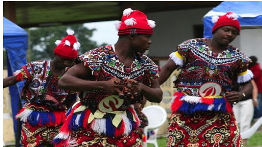
Port Harcourt Festival (Kids-World-Travel Guide)

With so many ethnic cultures in the country, there are many different customs. However, dance and singing are popular everywhere, as can be seen at the port Harcourt Festival every year.