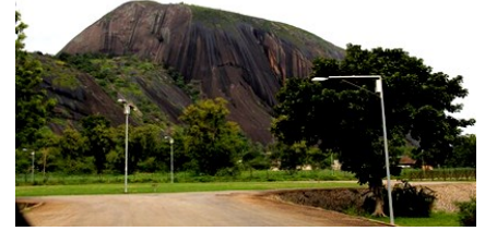
Zuma Rock

Located near the capital city of Abuja is Zuma Rock, one of several large monoliths within the country. It has a circumference of 3.1 km and is featured on one of the bank notes.