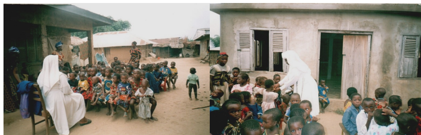
HCA Coordinator visits children and distribute snacks to them

The first project is primarily providing money to families so that their children can be enrolled in a quality school. Too many children in the area do not go to school at all because families cannot afford the extra fees required. Those who do attend school are usually in schools of very low standard that lack facilities, so minimal learning occurs. Moral and Religious Education rarely occurs.