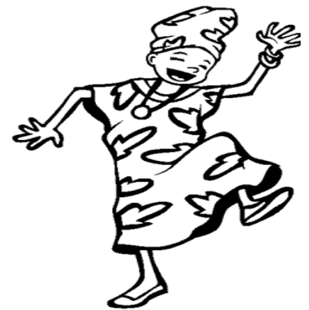
(thecolor.com) Colour your dancer