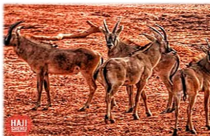
Yankari Game Reserve