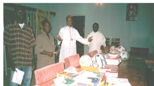
Some of the teaching and learning materials bought with the money given by HCA Canada. The Archbishop is presenting them to the priests of those schools concerned.