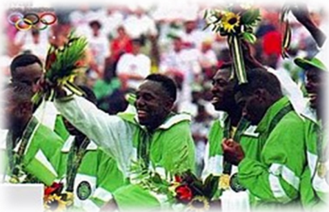
1996 Olympic gold medal (public domain)

Nigerians are very athletic, especially in soccer, boxing and track & field. In 1996, Nigeria defeated Argentina to win the football gold medal in Atlanta, the first African team to do so.