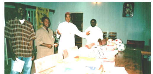
Some of the teaching and learning materials bought with the money given by HCA Canada. The Archbishop is presenting them to the priests of those schools concerned.

The first project is primarily providing money to families so that their children can be enrolled in a quality school. Too many children in the area do not go to school at all because families cannot afford the extra fees required. Those who do attend school are usually in schools of very low standard that lack facilities, so minimal learning occurs. Moral and Religious Education rarely occurs.