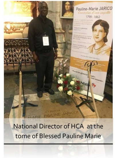
National Director of HCA at the tomb of Blessed Pauline Marie