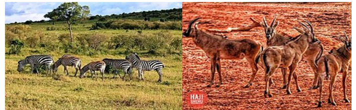
Yankari Game Reserve

Africa! Bet you thought of animals. With such a large population, animals have not had much space to prosper. Traditional African wildlife is seen mostly in the Game Reserves.