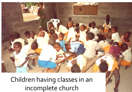
Children having classes in an incomplete church

The HCA is presently contributing to two educational projects in the diocese of Newi in the Southeast. This is an area of Nigeria with a population made up mostly with an Igbo (Ibo) population. Given the history of the area, people are on the poor side.