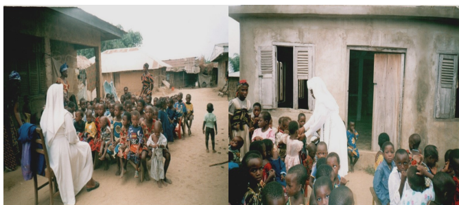
HCA Coordinator visits children and distribute snacks to them

The second project is at St Gabriel's outstation near Okija. There is no school in the area, so the only option for the few children who do attend is extensive and dangerous travel. The project is trying to raise money for the building of an early childhood and primary school.