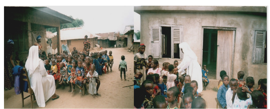
HCA Coordinator visits children and distribute snacks to them