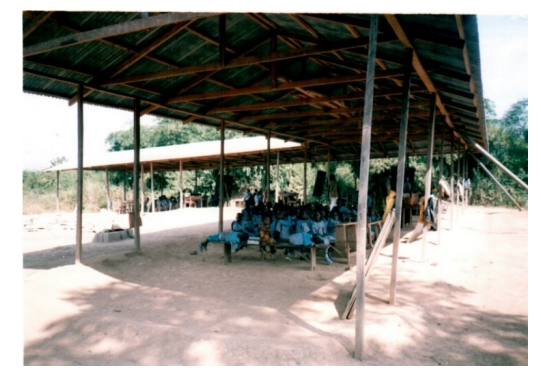
Nursery and Primary school children in classes

The second project is at St Gabriel's outstation near Okija. There is no school in the area, so the only option for the few children who do attend is extensive and dangerous travel. The project is trying to raise money for the building of an early childhood and primary school.