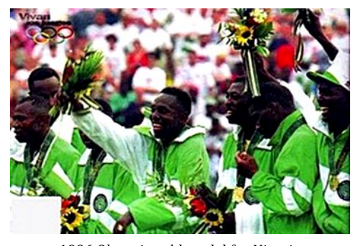
1996 Olympic gold medal for Nigeria (public domain)