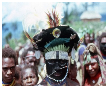
Male ceremonial/cultural regalia (Enga Province)