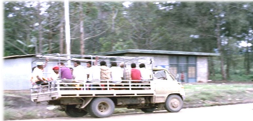
Public Motor Vehicle – (PMV)