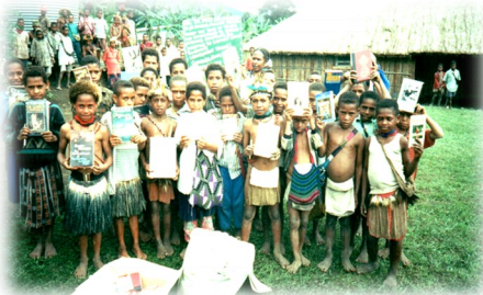
Bush School in remote PNG receives support from HCA Canada

Most children today attend Primary School until Year 6. Some will complete Year 10, after which a smaller number will go on to colleges to become teachers or trades workers. The Catholic Church is very active in working in schools. Priests and Catechists walk long distances between communities to offer support. Students and teachers do all of the cleaning and maintenance chores. In remote areas, they even build the schools before classes start!