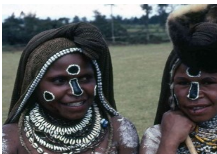
Female face decoration

There are many different cultural groups within PNG. All Papua New Guineans are known for their body art and dances. Thus Engans have their own unique styles, as shown here.