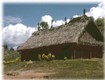
Catholic Church, Paiela

People in most areas of Enga are subsistence villagers who grow their food and raise pigs. They are generally healthy and happy people. Inevitably, the modern world has crept into Papua New Guinea and initiated changes. Many tribes have only recently been exposed to “modern” lifestyle, culture and Christianity. The Highlands of PNG were only “discovered” in the 1930s. There are people today who have never seen Western/ European people.