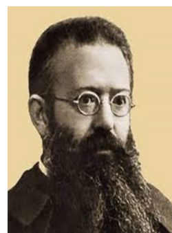
Father Paolo Manna