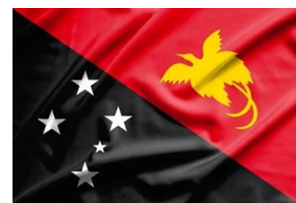
PNG flag