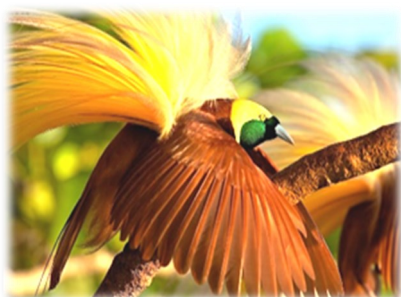
Bird of Paradise – National emblem