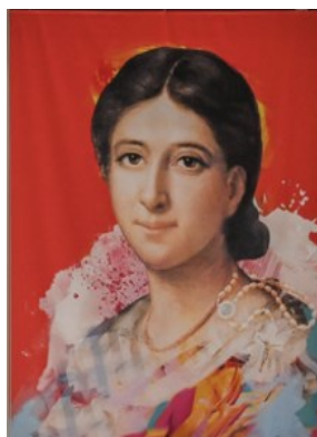
Foundress: Society for the Propagation of the Faith