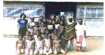
Mixed class - Paiela