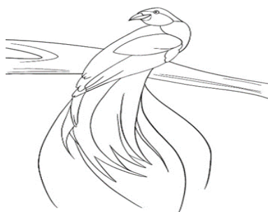
Colour your Bird of Paradise