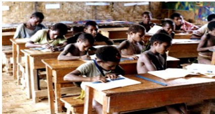
Students hard at work

The following pictures are from a remote town called Paiela. The writer of this Newsletter (pictured) spent time in the local school and village.