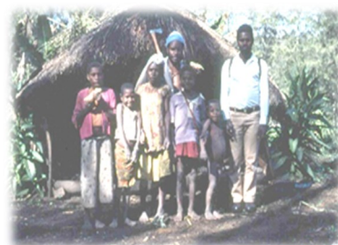
Villagers & their home

Your work with the HCA can ensure that children from these areas can continue their education and spiritual growth and lead productive lives.