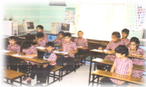
Working with impaired students, Rajkot diocese

The second project is in the Diocese of Rajkot in the west of India near the Pakistani border. There are several components to the work that is occurring. A major portion is providing accommodation and schooling for mentally impaired children and children with physical disabilities. The goal is to support the education of these young people so that they can be integrated into mainstream society.