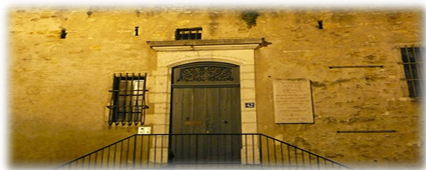
Maison de Lorette, house of Pauline Jaricot

In 1963, Pope John XXIII declared Pauline Venerable . This is the first step in being officially made a Saint of the Church. The second step is Beatification . This step requires the Church to recognise a miracle to have been performed through her intercession. This occurred on May 26, 2020. It is anticipated that she will be beatified by Pope Francis in May 2022 in Lyon.