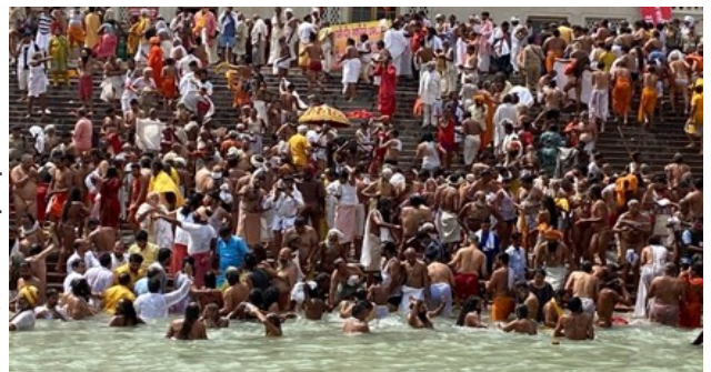
Indians bathe in the River Ganges

As 80 per cent of Indians are Hindu, the annual festival of Kumbh Mela is the largest pilgrimage in the world. Millions of people bathe in the Ganges River to wash away their sins and achieve immortality. There are concerns about this event because of COVID19.