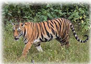
Bengal tiger

Bengal Tiger: The Bengal tiger is the largest of the wild cats in the world. It is threatened by poaching and loss of environment.