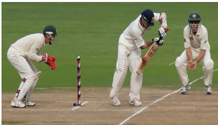
Sachin Tendulkar batting against Australia

India excels in the sport of Field Hockey and has been successful over the years at the International level. However, the most popular sport in terms of participation and spectators is cricket, where India has been one of the top teams for several years. There are very strong domestic tournaments and India is very competitive at World Cup competitions and International Test series. Top players, such as Sachin Tendulkar, become very wealthy and gain high popularity throughout the country.