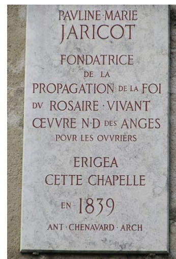
Plaque on Pauline's chapel

BLESSED PAULINE MARIE JARICOT - Pray for us