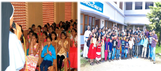
(Children's retreat, Palghat diocese)

The HCA currently has several projects that are being sponsored in India, two of which are described here.