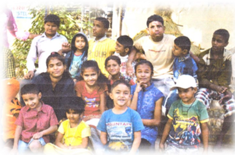
Students with disabilities, Rajkot diocese

The second project is in the Diocese of Rajkot in the west of India near the Pakistani border. There are several components to the work that is occurring. A major portion is providing accommodation and schooling for mentally impaired children and children with physical disabilities. The goal is to support the education of these young people so that they can be integrated into mainstream society.