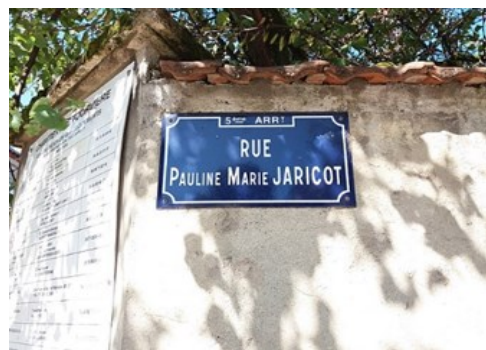
Street in Lyon (Public Domain)