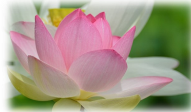
Lotus flower