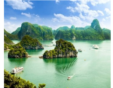
Ha Long Bay

Today, Vietnam is a thriving country and a popular tourist destination. Many Canadians have travelled to Vietnam in recent years. It has wonderful tropical climate, extensive beaches, exotic rainforest areas and large, bustling cities.