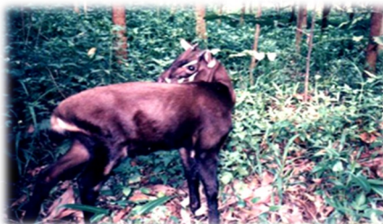
Rare Saola antelope

There are unusual animals, such as Indochinese tigers and the extremely rare saola antelope, in the tropical forests. See what you can find out about them.