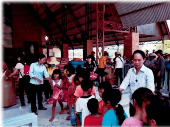
Covid_19 relief for poor families