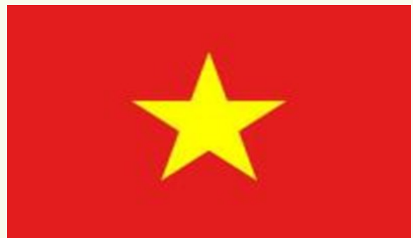
Flag of Vietnam