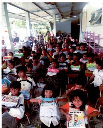
Chau Ma children

The HCA is currently supporting a group of Chau Ma families, members of an ethnic minority in Bon-go village. The area in which they have lived since reunification in 1975 is developing, but the people are still very poor. HCA assistance helps the Our Lady of the Missions group with providing educational needs: tuition fees, pens, pencils, books, uniforms. The children also receive food assistance to improve overall health concerns. The sisters also organise annual excursions to broaden the horizons of the children. This year, all educational programmes have been affected by the COVID-19 pandemic, but the mission has continued and worked effectively under the conditions.