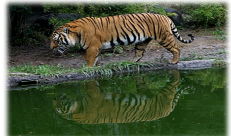
Indochinese Tiger