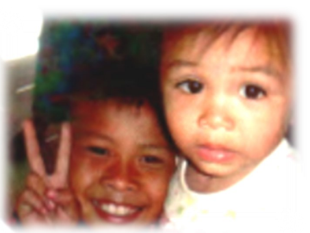
Girls at OLR Boarding House