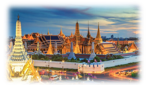
Grand Palace, Bangkok kids-world-travel-guide.com)

Thailand has many Buddhist temples and monuments that attract worshippers and tourists.