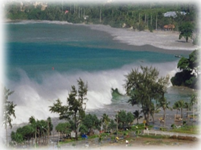
Patong Beach, Phuket