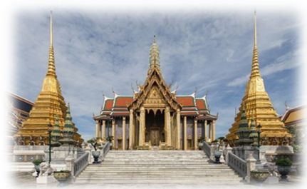
Wat Phra Kaew, Bangkok