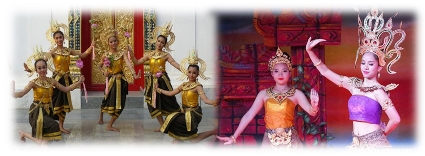
GNU Free Documentation License

There are different forms of dance in Thailand. Traditionally, kindness, grace and beauty are reflected in traditional dance. The dances are hypnotic and follow lovely rhythms made from oriental musical instruments. The dances have ancient roots and have been used to entertain guests over the centuries.