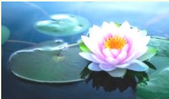
Lotus blossom (CCA 2.0)