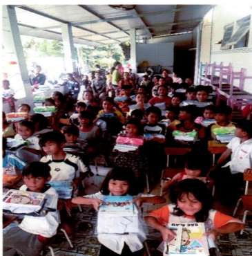
Chau Ma children

The HCA is currently supporting a group of Chau Ma families, members of an ethnic minority in Bon-go village. The area in which they have lived since reunification in 1975 is developing, but the people are still very poor. HCA assistance helps the Our Lady of the Missions group with providing educational needs: tuition fees, pens, pencils, books, uniforms. The children also receive food assistance to improve overall health concerns. The sisters also organise annual excursions to broaden the horizons of the children. This year, all educational programmes have been affected by the COVID-19 pandemic, but the mission has continued and worked effectively under the conditions.