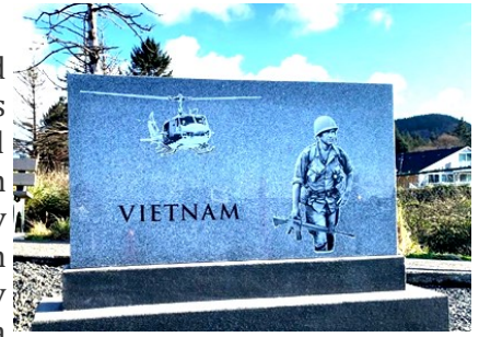
US War Memorial

Throughout history, Vietnam fluctuated between Chinese domination and tribal conflicts that resulted in an ever-changing political landscape. European colonial expansion resulted in Vietnam being administered by France by 1890. After the Japanese occupation during World War II, the Communist Party controlled the North. The South fought against a communist takeover, initially with the help of the French and then the Americans (commonly known as the Vietnam War). The North was victorious in 1975, and the country was later unified.