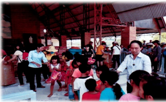
Covid_19 Pandemic relief for poor families