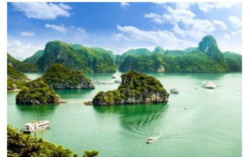
Ha Long Bay (National Geographic)