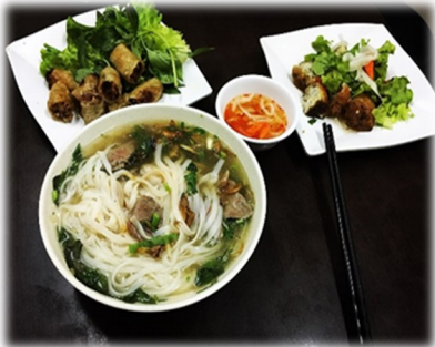
Popular food (CCA)

Today, Vietnam is a thriving country and a popular tourist destination. It is famous for its food which is a blend of Chinese and Thai styles and uses seafood and local fruits and vegetables. You can find many Vietnamese restaurants in Canada. The most popular sports are soccer, table tennis, volleyball and martial arts. The main agricultural products are rice, coffee, tea, pepper as well as soybeans, cashews, peanuts and rubber. Vietnam's main exports include crude oil, seafood, rice, shoes, wooden products, machinery, electronics, coffee, and clothing. There are exotic animals, such as Indochinese tigers and the extremely rare saola antelope, in the tropical forests.