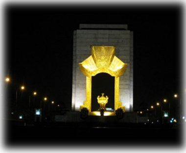
Hanoi War Memorial

Throughout history, Vietnam fluctuated between Chinese domination and tribal conflicts that resulted in an ever-changing political landscape. European colonial expansion resulted in Vietnam being administered by France by 1890. After the Japanese occupation during World War II, the Communist Party controlled the North. The South fought against a communist takeover, initially with the help of the French and then the Americans (commonly known as the Vietnam War). The North was victorious in 1975, and the country was later unified.