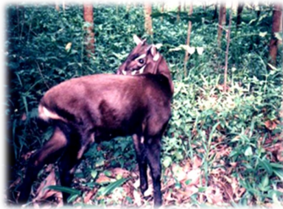
Rare Saola antelope