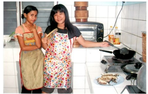
Girls at OLR Boarding House