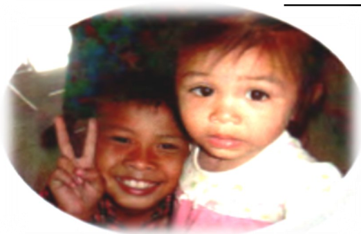
Children at the MPH Aids Centre